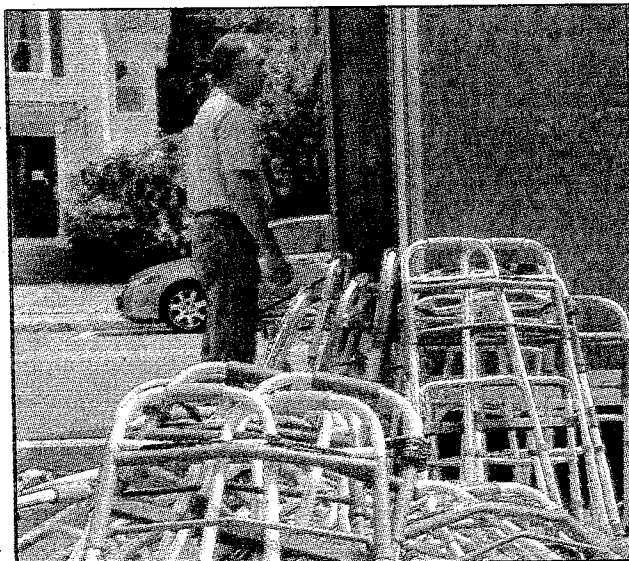
Community Caregivers of Greater Derry are giving many medical items to a relief effort that will send the walkers, canes, and other supplies to the Dominican Republic and Haiti.