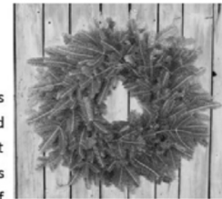
Back of a Plain Wreath

Three Rivers Wreaths are always double faced. This means that wreaths are the same on the front and the back unlike our single-faced competitors. Hang our wreaths in a window or on a front door and don't worry about a metal frame banging or scratching your home. Our quality is hard to beat and your customers will easily notice the superior standard of a Three Rivers Wreath!