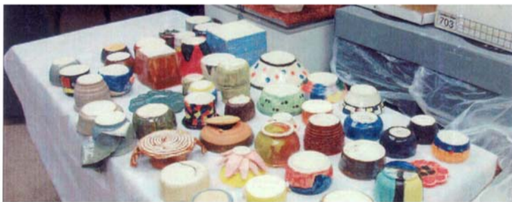
Some of the pottery bowls donated to the Potter's Bowl fundraiser event on Feb. 2.