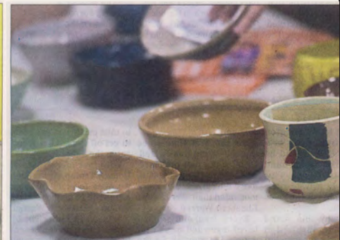
Attendees picked out a bowl to fill with soup.